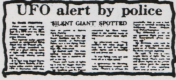
• A recent sighting — from Wednesday's Mail

Three weeks before that, a sister, two staff nurses and a doctor at Good Hope Hospital, Sutton Coldfield, saw a cigar-shaped object 400ft by 60ft, hovering with lights all round it. Birmingham Airport said there been a brief showing on radar — but again, there